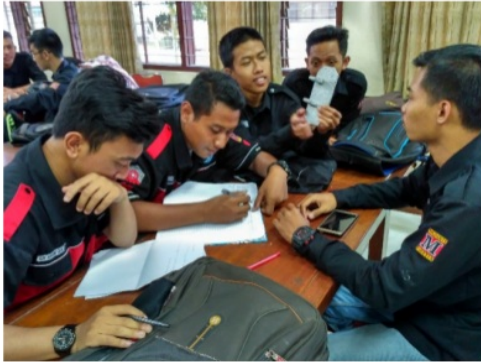
Figure 5. Discussion to analyze casting product

Each group has finish practicing the casting process and obtain a product that correspond with the pattern. However, there are two groups that failed making product using styrofoam pattern. One group is inappropriate in making the gating system and causing the molten metal cannot fill the mold cavity well. The unsuccessful of the other group is caused by improper in predicting the amount of poured molten metal so the mold cavity not full filled. On casting using wood pattern, each group obtain casting product that consistent with pattern. The competencies possessed by student in pressureless casting after casting practice is shown in Table 1. It is obvious that the casting laboratory of MEED YSU is effective in