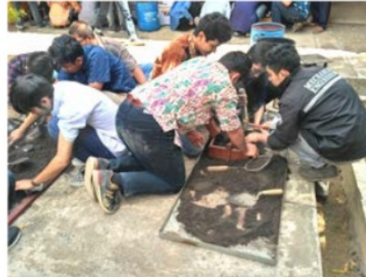
Figure 2. Students practicing making sand mold

carefully. Otherwise, defects on the casting product will appear due to the trapped sublimated styrofoam when the molten aluminum is poured.