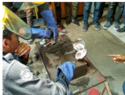
Figure 3. Students poured molten aluminum into the sand mold

Aluminum smelting process was conducted when students making the sand mold. In smelting process, students preparing aluminum raw material, furnace, and other equipments. The smelting process is done in a crucible furnace that equipped with economizer using spiral finned pot (Arianto, et.al, 2017: 1-6). The competence that build in this step are ability in preparing raw material, operating the crucible furnace, put in the material to be smelted, and also predict and measure pouring temperature. The smelting process was conducted in such way so that the aluminum melted when process of mold making is finish. This is for efficiency of the practice time. The aluminum requirement for practice of 8 groups is 12-15 kg and it took around 30 minutes for smelting process and requires 3 kg of Liquid Petroleum Gas (LPG).